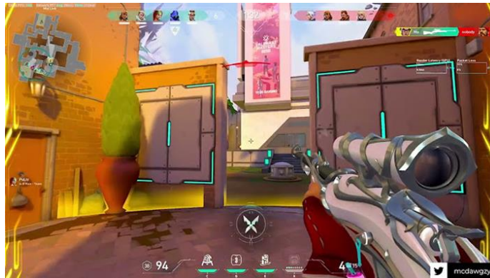
Figure 1 Capture of Valorant's gameplay

The game's objective is for a team to reach a score of 13 first, and in the event of a 12-12 tie, the winning team must secure a two-point advantage, akin to the rules of a volleyball match. Each team comprises five players randomly assigned to a map and a role, either attacker or defender. Attackers aim to plant the bomb, referred to as the "spike," at a designated site, earning a point upon successful detonation or elimination of the opposing team. Defenders seek to prevent the spike from being planted and defuse it if necessary, earning a point in the process. Role swap occurs at the 12th round, with attackers becoming defenders and vice versa.