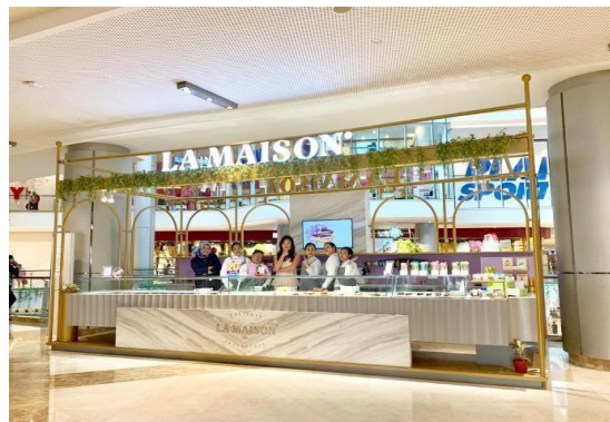
Figure 5 La Maison Store

People that are interested with La Maison's product will search for information about the La Maison store location. The Information can be found through their instagram account @lamaison.id and website Lamaison.id. They have 5 stores, 2 in Medan on Biduk street and Sun Plaza, and 3 stores in Jakarta which are in Grand Indonesia, PIK Avenue Mall, and Plaza Senayan. For more information about the price list and other things can be found in La Maison's instagram bio.