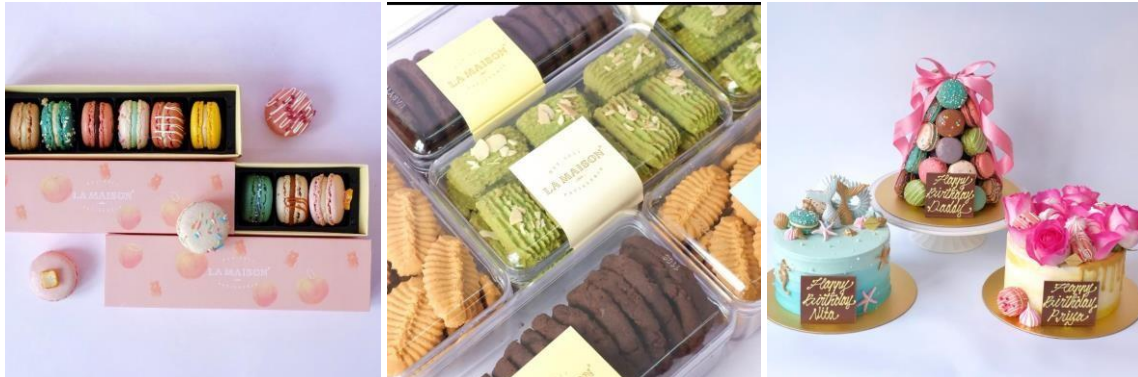
Figure 6 La Maison Products