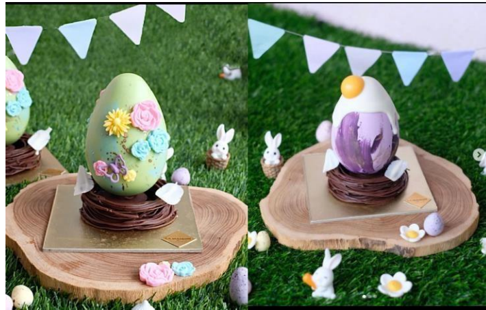
Figure 4 Easter Edition's Product