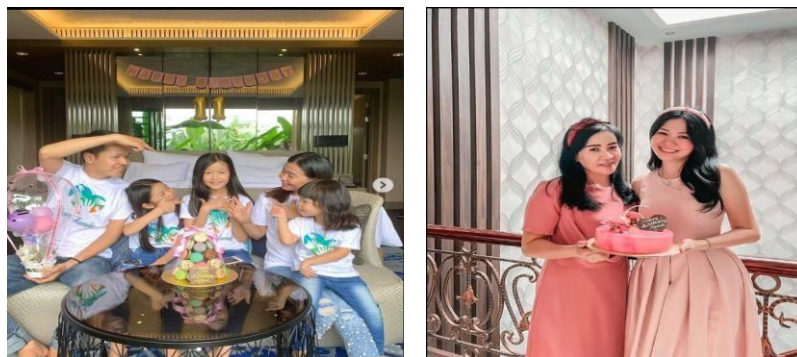
Figure 7 Family picture that celebrate their birthday with macaroon and cake from La Maison

Then for the satisfaction of buyers, there are consumer testimonials to share their experiences on Instagram. By posting photos and videos on Instagram feeds/reels and then tagging Instagram Lamaison.id. In addition, to maintain a good image with consumers, La Maison always comments and likes on consumers' Instagram posts.