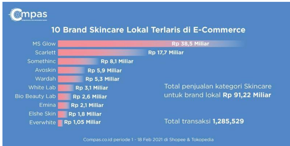
Figure 1. 10 Best Selling Local Skincare Brands

promote products (Saebah & Asikin, 2022). Based on the results of a survey by the Indonesian Internet Service Providers Association (2020) states that beauty products are the most frequently purchased needs online after food needs, so this is both an opportunity and a challenge for beauty businesses in online media. Sales for skincare brands in Indonesia are also growing rapidly. Reporting from compas.co.id (2021), there are ten well-known local skincare brands in Indonesia that have the best-selling sales, where MS Glow ranks first among its competitors.